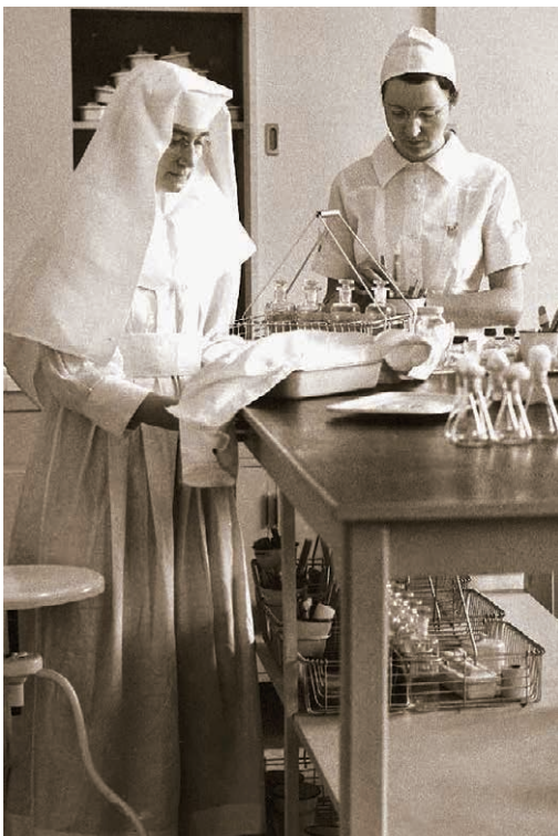
The Sisters of Charity of the Incarnate Word played a vital role in the development of health care in Long Beach and other communities throughout the United States.

West (renamed Dignity Health in 2012), continuing the Sisters' ministry of service. They remain an active and vital presence at both Dignity Health and St. Mary, serving in administration, spiritual care services, on boards, and as patient representatives.