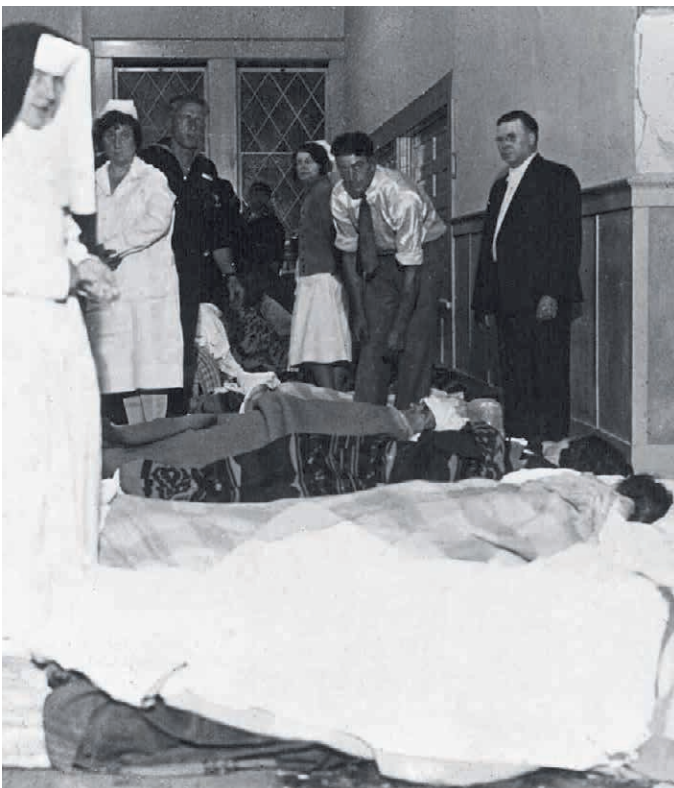
The Sisters set up makeshift hospital wards in the aftermath of the 1933 Long Beach earthquake, which destroyed the original hospital and injured hundreds of residents.

In 1987, the Sisters responded to yet another crisis: the influx of Cambodian refugees fleeing the Khmer Rouge. The Sisters partnered with the United Cambodian Community to establish the Southeast Asian Health Project, providing desperately needed health and medical care. The program has evolved into St. Mary’s Families in Good Health, a multicultural, multilingual health and social education program offering outreach and case management services to low-income communities.