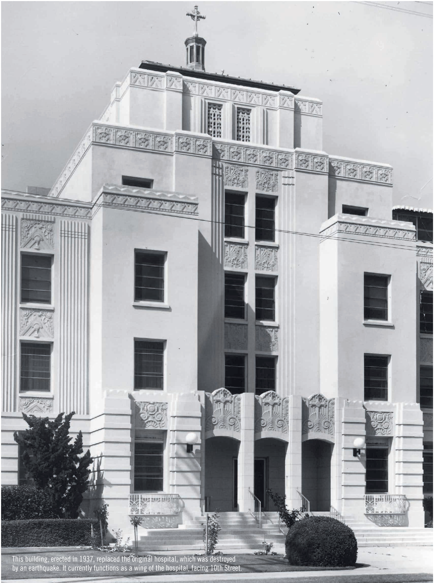
This building, erected in 1937, replaced the original hospital, which was destroyed by an earthquake. It currently functions as a wing of the hospital, facing 10th Street.