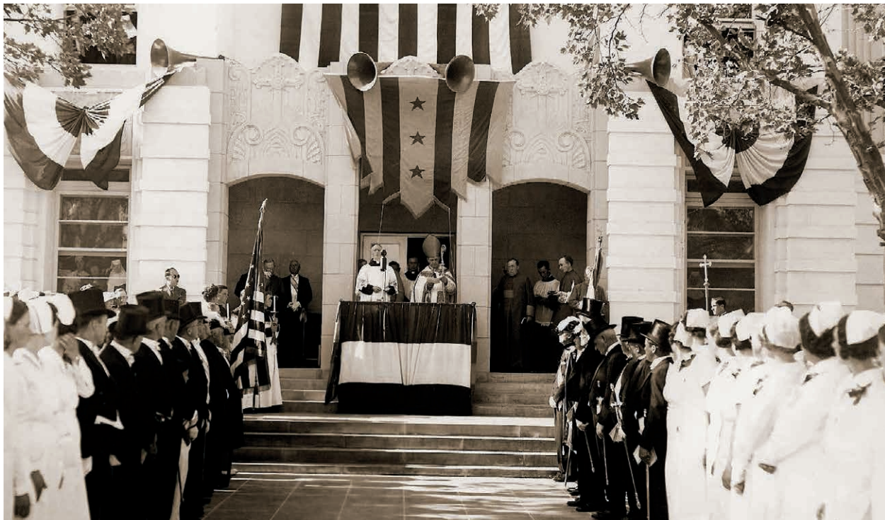
Dedication of the new St. Mary Hospital in 1937. The original hospital building was destroyed in the 1933 Long Beach earthquake.