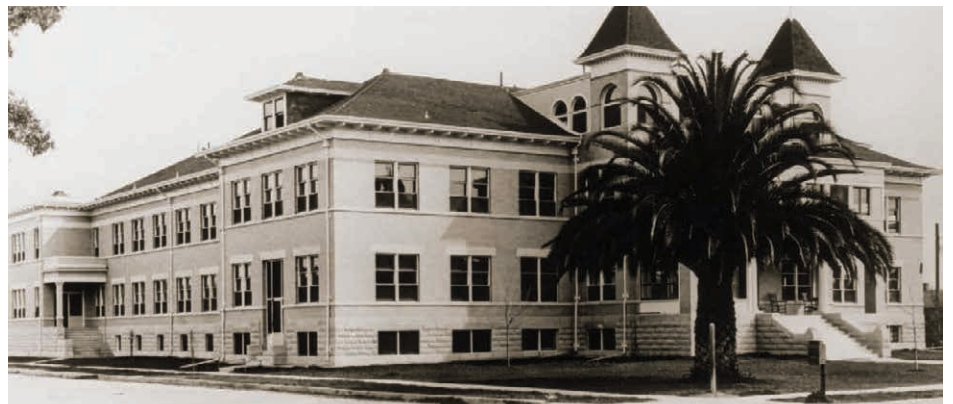
The original St. Mary Hospital opened in 1923 after the Sisters purchased and refurbished the Long Beach Sanitarium.