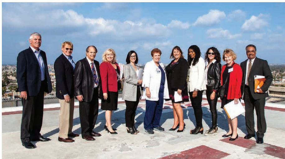
The Ambassadors' hospital tour included visiting the rooftop helipad for critically injured patient transport.

Ambassadors were invited to join one of several subcommittees that will support Foundation initiatives in the coming year. For more information about becoming an Ambassador, please contact the Foundation at 562.491.9225.