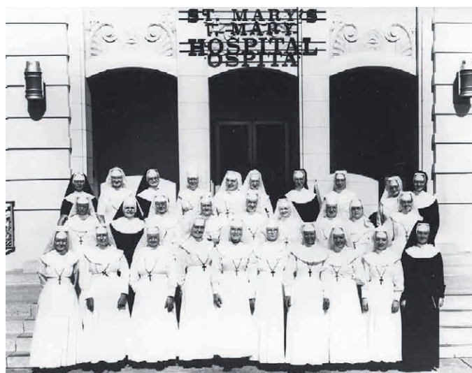
The Sisters of Charity of the Incarnate Word pose for a photo in front of the rebuilt hospital in 1937.